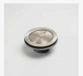
AC28 Basket Waste