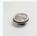
AC28 Basket Waste