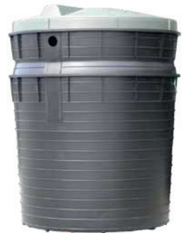
4000L Septic Tank

*It is a legal requirement that all domestic septic tanks over 2050L in NSW & VIC be installed with a partition. Larger capacity collection wells available using multiple tanks.