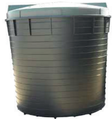
2500L Septic Tank - Deep Invert/ 3000L Septic Tank