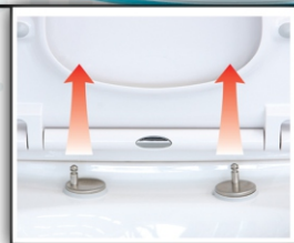
One Button Quick Release Seat