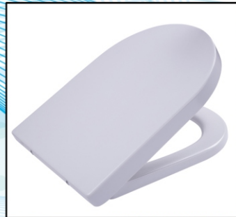
Ceramic Look & Feel