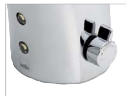
Inset: Optional temperature adjustment lever.